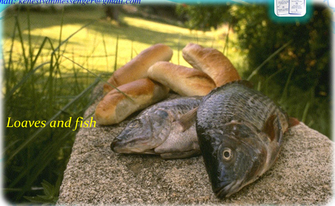
Loaves and fish

From only five loaves of bread and two fish Yahshuah fed 5,000 men plus women and children by the shore of the Sea of Galilee. They all ate till they were filled and afterward Yahshuah' disciples collected 12 baskets full of fragments. The Sea of Galilee (Tiberias) is a lake in northern Israel through which the Jordan River flows. Many episodes in the life of Messiahtook place on or around this historic lake.